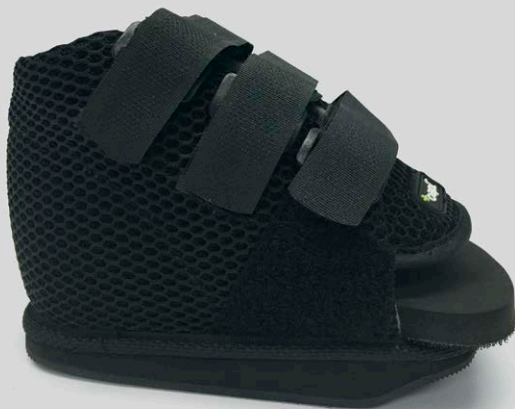
OAPL BUNION BOOT