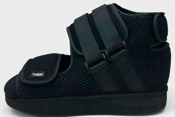
OAPL ADL SHOE