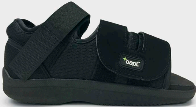
OAPL SQUARE TOE SHOE