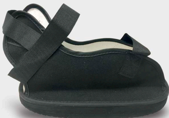
OAPL CAST SHOE