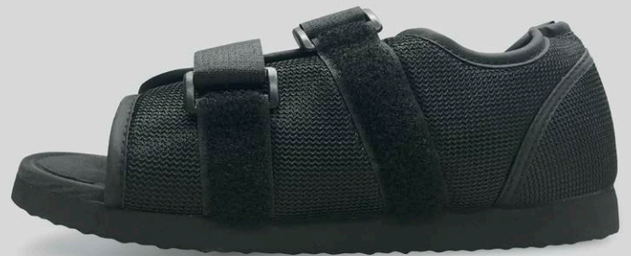
OAPL POST OP SHOE